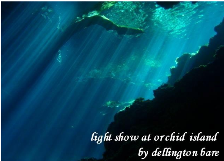
light show at orchid island by dellington bare