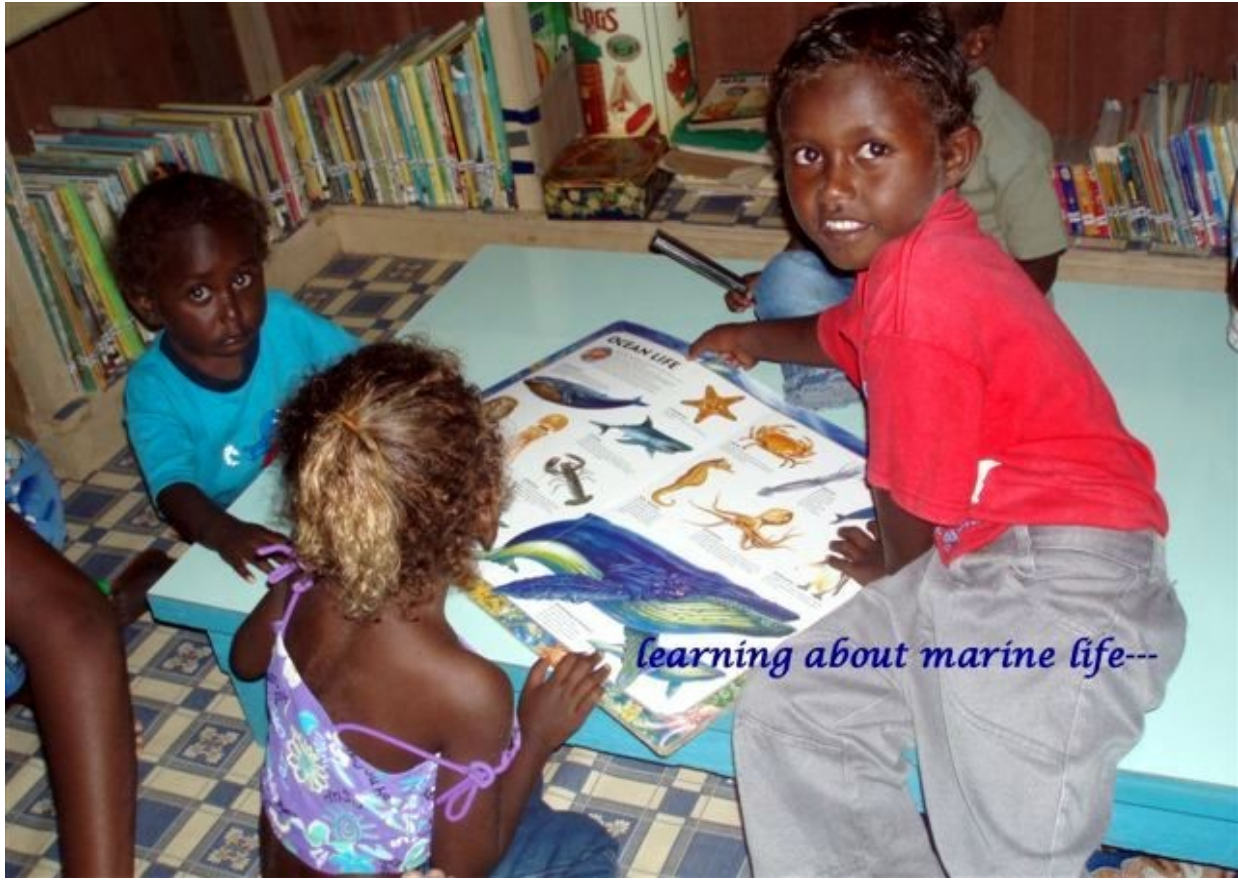
learning about marine life---