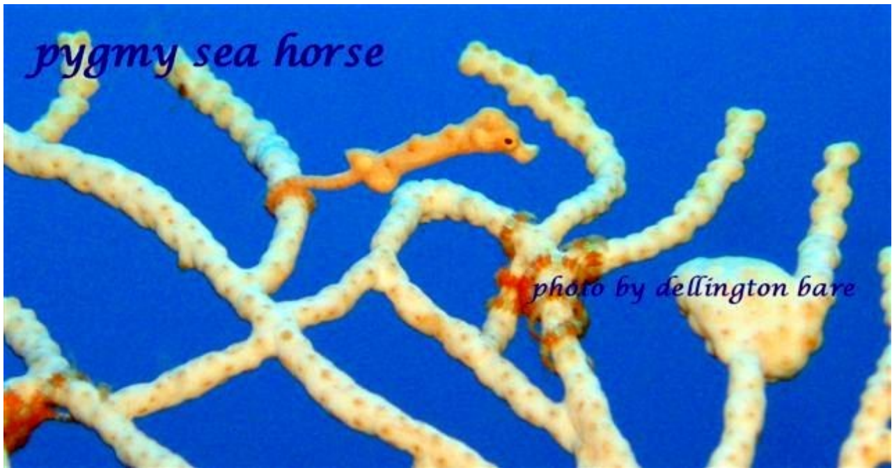
pygmy sea horse